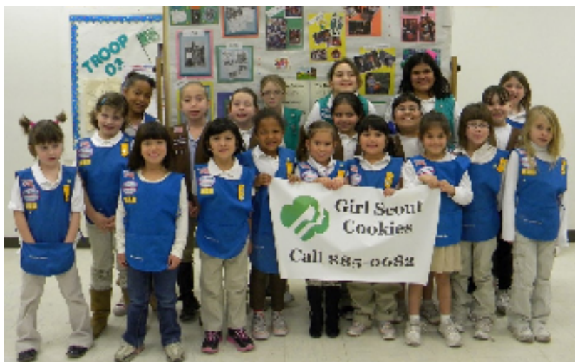
Girl Scout Troop #12003