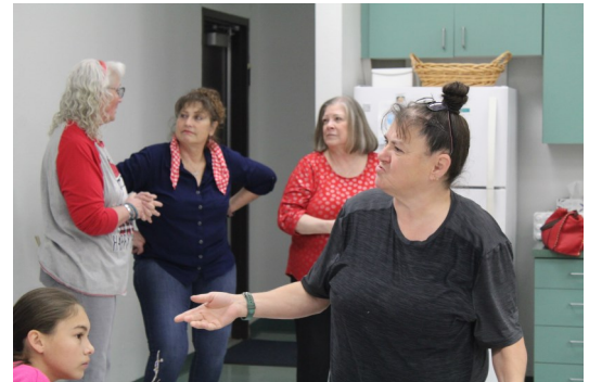
Ministry Appreciation Luncheon highlights, December 16, 2023